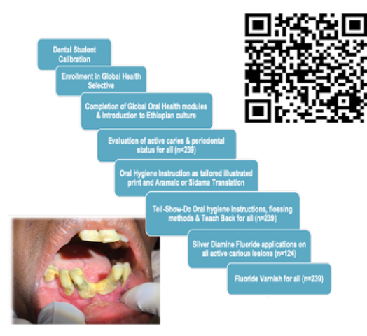
Fig.1: The process